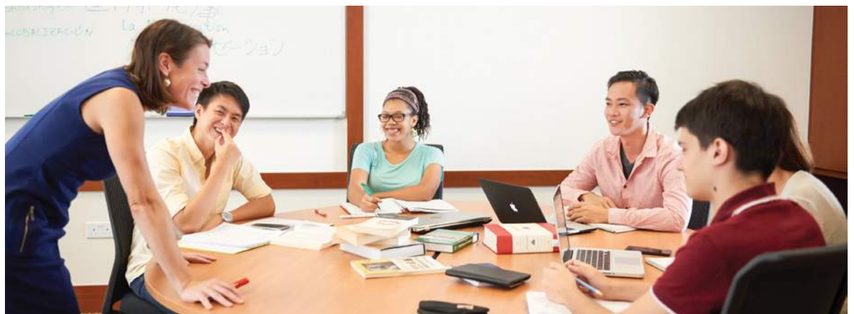
Yale-NUS College students. SIA supports several initiatives at the College.

"Singapore Airlines recognises the importance of building strong relationships with the many communities we serve, and demonstrating our care for them."