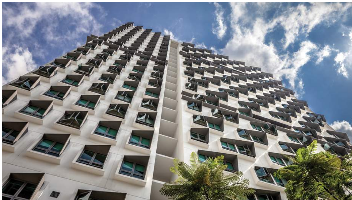
Tembusu College, NUS University Town